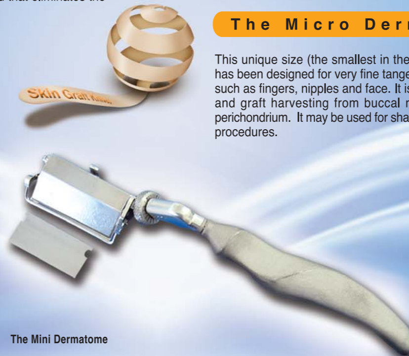
The Mini Dermatome