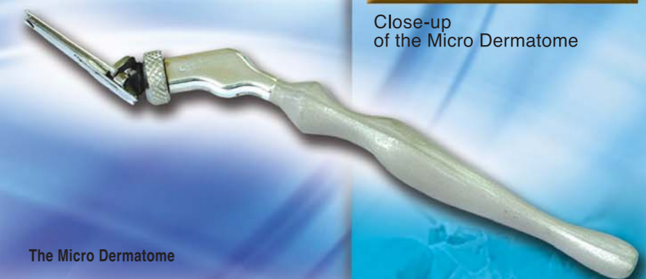
The Micro Dermatome