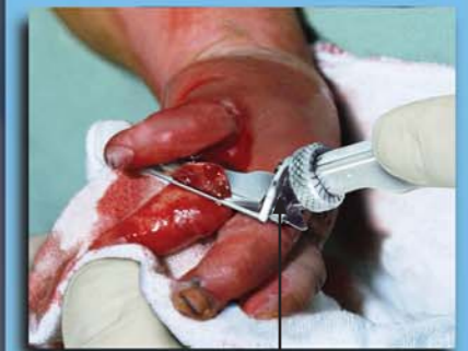
Easy access during surgical intervention

This unique size (the smallest in the world) and slim shape of this Skin Graft Knife has been designed for very fine tangential excision and de-epidermization from areas such as fingers, nipples and face. It is also useful for small cutaneous lesion removal and graft harvesting from buccal mucosa, retro-auricular region, cartilage and perichondrium. It may be used for shaping and splitting cartilage grafts in reconstructive procedures.