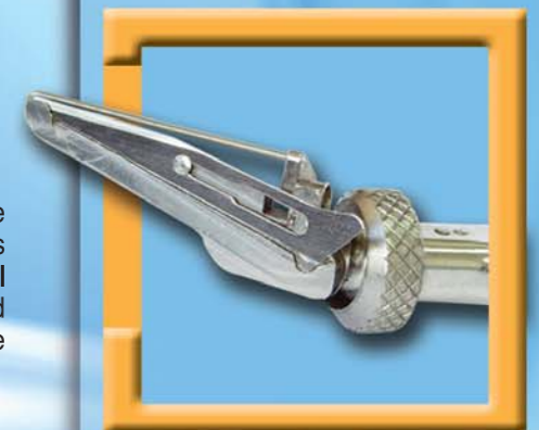
Close-up of the Micro Dermatome