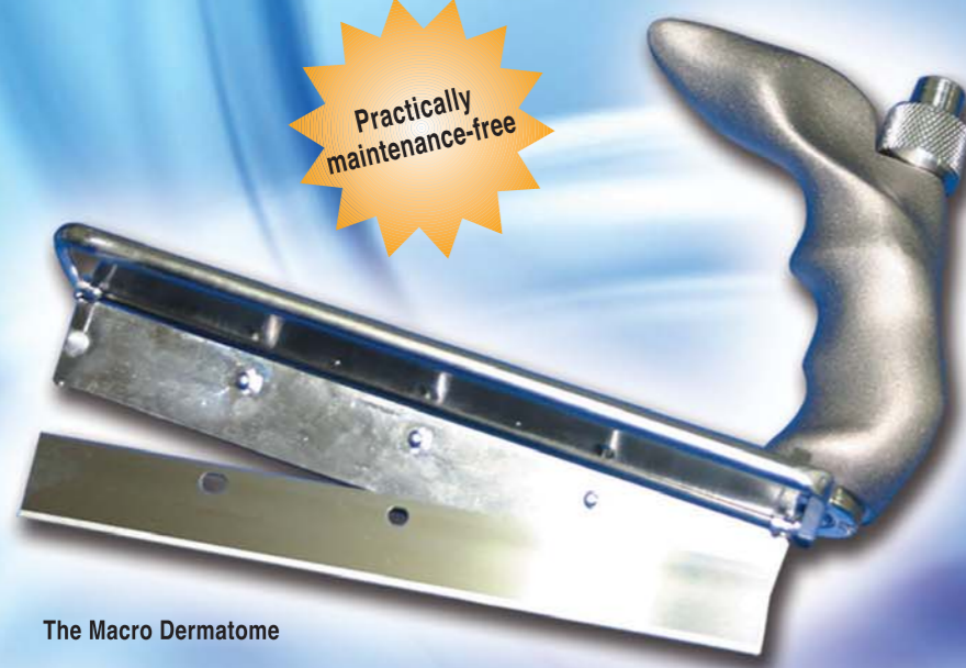
The Macro Dermatome